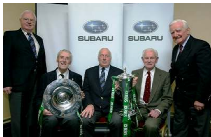
A recent photograph of the Leinster Branch rugby referees meeting showing trophies won by Ireland last season.