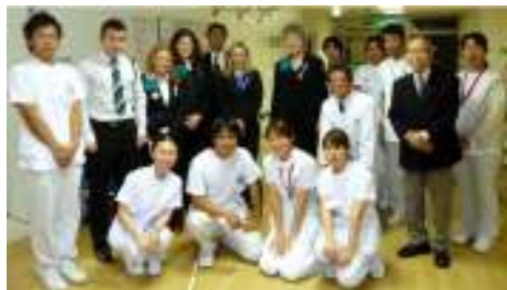
Visit to private hospital in Kasaoka, Okayama, on Pacific Coast